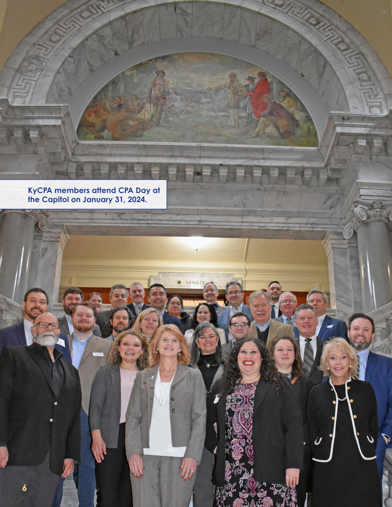
KyCPA members attend CPA Day at the Capitol on January 31, 2024.